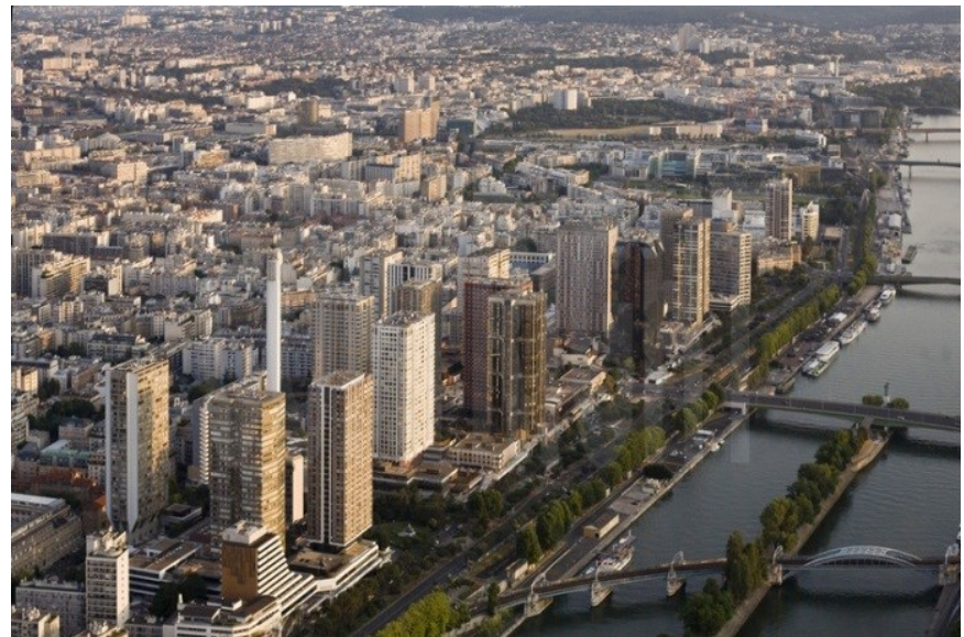
Paris, Front de Seine